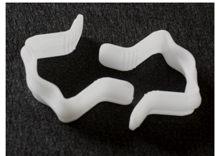
A. U clips (x 4)

NOTE: DO NOT LIFT THE SIDE WITH THE CROCODILE CLIP AS YOU WILL BREAK IT.