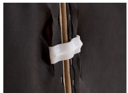
C. U clips (once inserted)